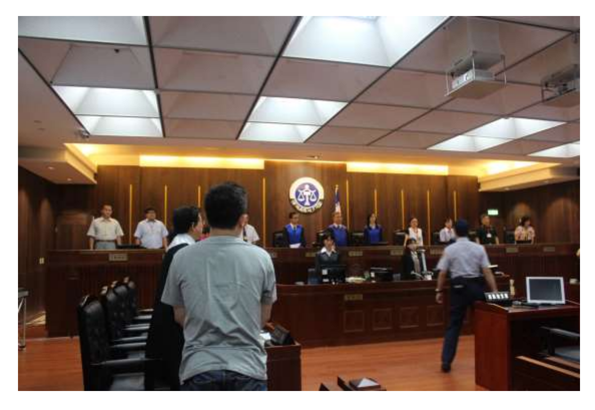
Mock Mixed Court of Professional and Citizen Judges, Taiwan, July 2014